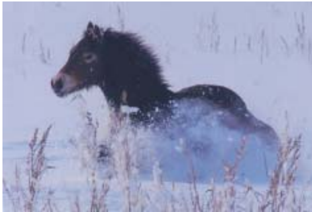
PRINT CHAMPION: Fiona Macnee