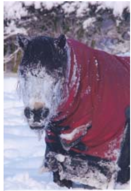
PRINT RESERVE CHAMPION: Fiona Macnee